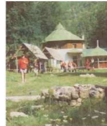
Dobro jutro, splavarji - Počivališće Radovan luka

The price is calculated for a minimum of 10 participants per raft. Individual guests as well as groups are welcome.